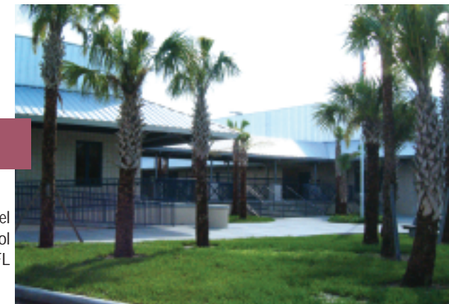
Sanibel School Sanibel, FL