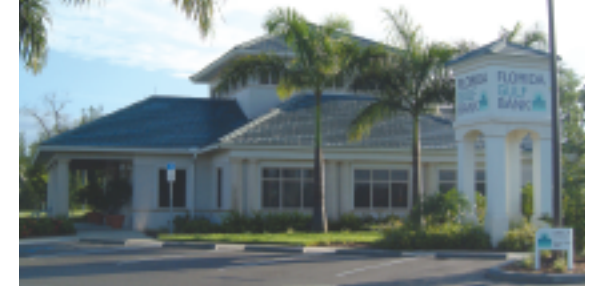
Florida Gulf Bank Fort Myers, FL