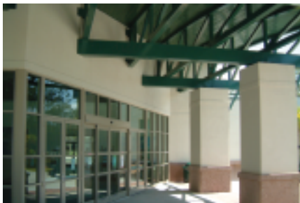
FGCU Fine Arts Building Esterro, FL