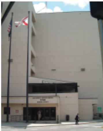
Lee County Justice Center Fort Myers, FL