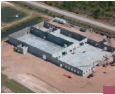
Lee County Firing Range Fort Myers, FL